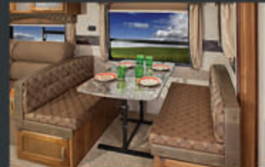
"DO-MORE" DINETTE TABLE