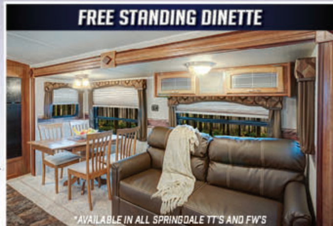
FREE STANDING DINETTE

VISIT OUR WEBSITE TO VIEW INTERIOR PHOTOS, 360 VIRTUAL TOURS AND MUCH MORE.