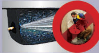
BLACK TANK FLUSH