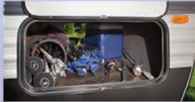
EXTRA LARGE PASS THRU STORAGE DOOR