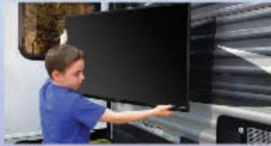
OUTDOOR TV BRACKET W/TV HOOKUP