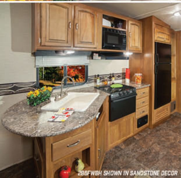
286FWBH SHOWN IN SANDSTONE DECOR