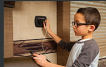
DIGITAL CHARGING STATION