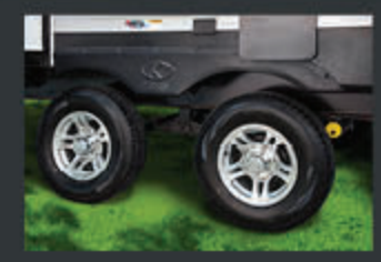
WIDE STANCE AXLES