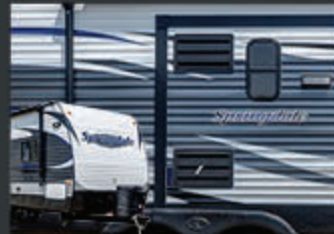
FULL BODY GRAPHICS