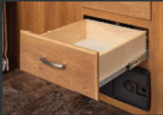
FULL EXTENSION BALL BEARING ROLLER GUIDES