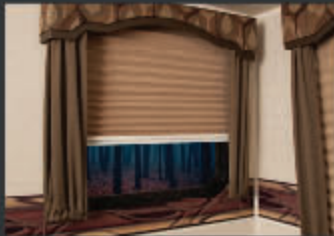
PLEATED NIGHT SHADES