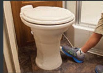
PORCELAIN FOOT FLUSH TOILET