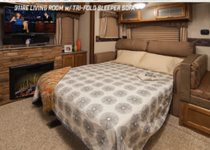
311RE LIVING ROOM w/ TRI-FOLD SLEEPER SOFA