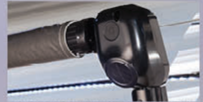
INTEGRATED AWNING SPEAKERS W/ LED LIGHT STRIP