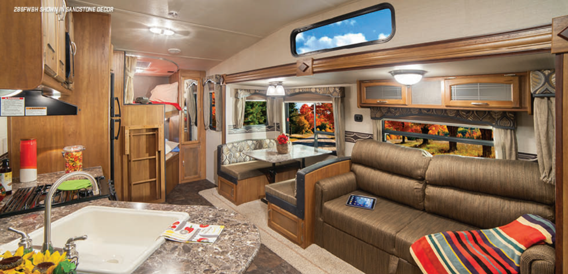
286FWBH SHOWN IN SANDSTONE DECOR