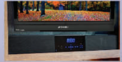
SOUND BAR ENTERTAINMENT CENTER