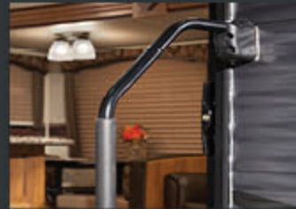
EXTRA LARGE ENTRY HANDLE