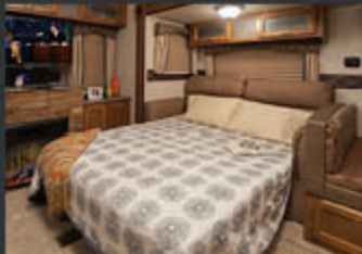
TRI-FOLD SLEEPER SOFA