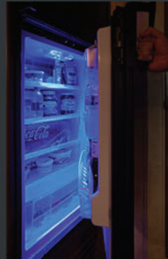
UPGRADED 7 CU. FT. REFER W/LED LIGHT