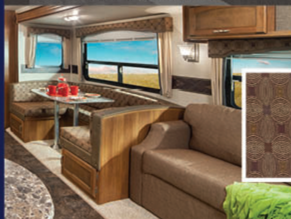
SEA MIST DECOR