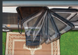
FRICTION HINGE DOOR